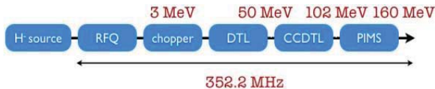
Figure 3: Linac4 layout.

Three different accelerating structures will be used in Linac4 after the radio-frequency quadrupole (RFQ), all at 352 MHz frequency. In particular, the Side Coupled Linac (SCL) at 704 MHz foreseen in previous designs has been replaced by a Pi-Mode Structure (PIMS) operating at the basic linac frequency [1, 2]. The Linac4 scheme with the transition energies is sketched in Fig. 3.