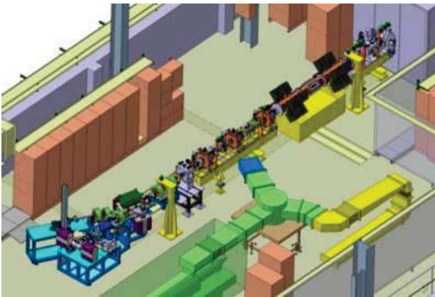
Figure 5: The Linac4 Test Stand.

The Linac4 front-end, consisting of ion source, RFQ and of the 3 MeV chopper line, is being progressively installed and tested in a dedicated test stand (Fig. 5). Together with commissioning of the first accelerating components, the test stand allows early testing and characterisation of the RF infrastructure (LEP klystron operating in pulsed mode, low-level RF, etc.), of the modulators, of beam instrumentation and of timing, control and interlock electronics. The test stand will be equipped with a movable beam diagnostics line, which will progressively analyse the different front-end sections.