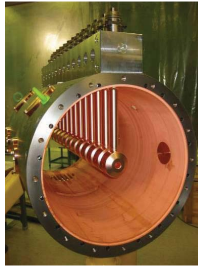
Figure 4: DTL prototype.

electromagnetic, and placed between the tanks. In this structure the drift tube alignment tolerances are considerably relaxed, and the quadrupoles are easily accessible for maintenance. The CCDTL design is now completed, and construction started in 2010 in the frame of a collaboration project with BINP, Novosibirsk and VNIITF, Snezhinsk.