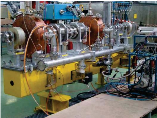
Figure 6: The chopper line assembled at the Linac4 Test Stand.

The test stand infrastructure has been completed in 2007. At the end of 2008, the klystron modulator has been commissioned with a LEP klystron in pulsed mode. At the same time, the complete chopper line (3.6 m) has been assembled and vacuum tested (Fig. 6). Installation and vacuum tests of the ion source have been completed, and commissioning of the H^- source has started in July 2009. Commissioning of the RFQ and of the chopper line will start after the delivery of the RFQ from the CERN workshop, presently foreseen for October 2010.