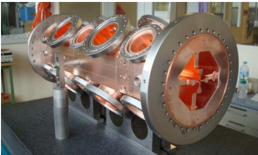
Figure 2: 3 rd RFQ module.

The 3-m long RFQ of the brazed-copper 4-vane type is entirely built in the CERN Workshop. A sequence of machining steps and thermal treatments allowed keeping vane position errors after brazing within the 30 \mu\text{m} tolerance. Figure 2 shows the third 1-m long segment ready for assembly.