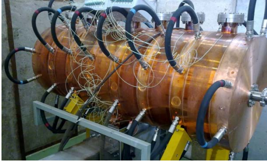
Figure 4: PIMS first cavity under high-power tests.

Additional contributions to the construction of the Linac4 accelerating cavities come from CEA (France, RF design and measurements of the RFQ), INFN (Italy, all RF tuners) and RRCAT (India, alignment jigs and sections of the RF couplers).