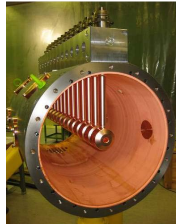
Figure 3: DTL prototype.

A Drift Tube Linac (DTL) divided in three tanks accelerates the beam up to 50 MeV. Focusing in the DTL is provided by 108 Permanent Magnet Quadrupoles (PMQ) placed in vacuum inside the drift tubes. The DTL is based on a new mechanical design allowing precise positioning of the drift tubes inside the tank, without the need for bellows or rubber vacuum joints to align the drift tubes after assembly. The principle has been tested on a 1.2 m long high-power prototype (Fig. 3) which has been conditioned up to the design voltage. Construction of the DTL has started; the components are being produced in industry, in collaboration with the ESS-Bilbao project. Assembly and tuning will be done at CERN.