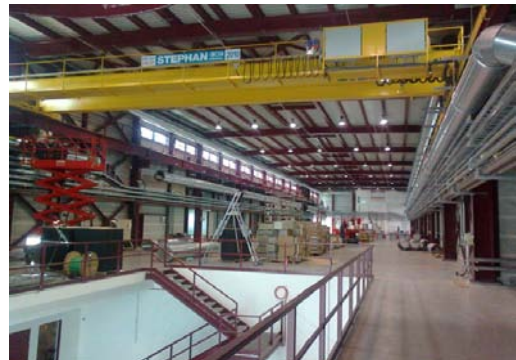
Figure 6: Linac4 equipment hall (May 2011).

The civil engineering works started in October 2008 and were completed in October 2010. After reception of the building and tunnel, the installation of electrical, cooling and ventilation infrastructure has started and will progress until June 2012. Part of the waveguides has been already installed in the surface building (Fig. 6); the cabling campaigns will start in autumn 2011.