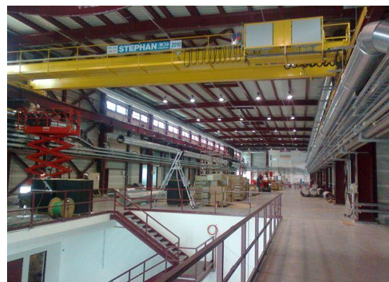
Figure 2: Infrastructure installation (Summer 2011).

Infrastructure is presently being installed (electricity, cooling and ventilation, cabling...) (Fig. 2). At the end of this phase, in June 2012, the installation of the accelerator components will begin.