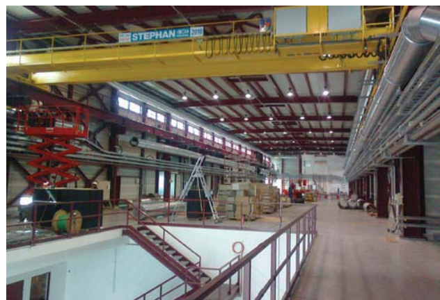
Figure 2: Infrastructure installation (Summer 2011).

Infrastructure is presently being installed (electricity, cooling and ventilation, cabling...) (Fig. 2). At the end of this phase, in June 2012, the installation of the accelerator components will begin.