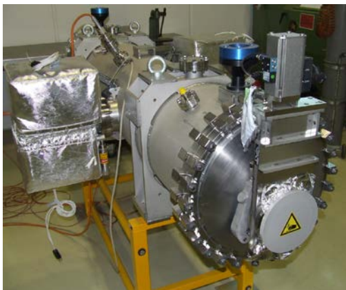
Figure 2: New distributor ready for installation.

In the injection line notably the system employed to split up the incoming beam into the planes of the four Booster rings is being rebuilt. This system consists of the distributor, a system of five pulsed magnets, which give an initial deflection to the beam slices destined to the different rings, followed by a vertical septum, which further increases the deflection angle. Both devices will be replaced by new ones that can operate at 160 MeV beam energy. The hardware is presently under construction at CERN. Figure 2 shows the new distributor ready for installation.