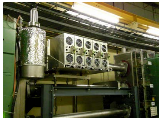
Figure 1: Prototype wideband cavity cells installed in Ring 4 of the PSB.