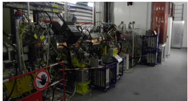
Figure 1: The Linac4 3 MeV section (from right: ion source, RFQ, chopper line) installed in the tunnel.

Following this initial commissioning phase, the 3 MeV injector and the measurement line were installed in their final location in the linac tunnel (Fig. 1) where another set of extensive beam measurements took place between end 2013 and beginning of 2014. The beam measurement line was then moved downstream in preparation for installation and beam commissioning of the first Drift Tube Linac (DTL) tank that has recently been assembled and tuned. In parallel, a new Cesium ion source was installed and commissioned in the test stand. It delivers a current of more than 50 mA and will be installed in the linac during summer 2014, to be used for the commissioning of the other two DTL tanks going up to 50 MeV and of the remaining linac sections.